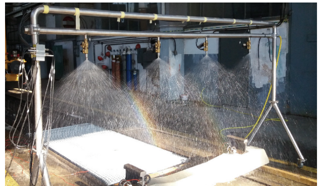
Fig. 5. Performing rail slipper resistance measurement

In the immediate future, the Laboratory will aim at further enlargement of the scope of accreditation for the calibration of instruments for railway applications. At first, the Laboratory wants to undertake elaboration of the accredited methodology for the calibration of instruments for measuring the distance between inner surfaces of wheels in wheelsets and instruments for measuring the diameters of wheels in wheelsets, which is based on three contact-points. It is also planned to construct a semi-automatic stand for calibration of manual and self-propelled track geometry trolleys.