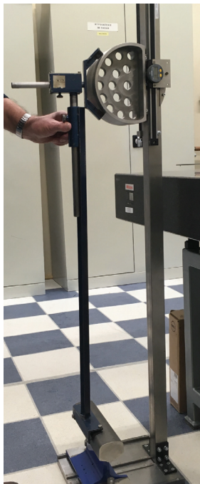
Fig. 3. Stand for calibration of instruments for measuring buffer centre line height over rails running surface

Moreover, the Laboratory obtained accreditation for AC resistance measurements, thanks to which it is able to perform accredited measurements of the resistance of slippers (see Figures 4 and 5).