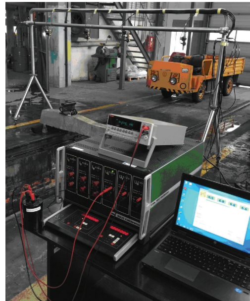
Fig. 4. Stand for measuring the resistance of slippers with fastening systems

Moreover, the Laboratory obtained accreditation for AC resistance measurements, thanks to which it is able to perform accredited measurements of the resistance of slippers (see Figures 4 and 5).